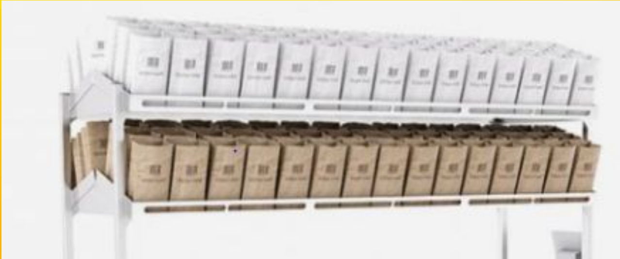
Grab & Go Meal Set Up